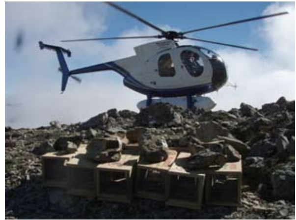
Trap deployment on the top of the St Arnaud Range.

Since December 2007 there has been a concerted effort to get the new DOC200 and DOC250 traps out on the hill. This is the first part of a staged approach to eventually replacing all 990 Fenn traps with traps that meet DOC best practice. Helicopters were used to help begin replacing traps along the top of the St Arnaud range with DOC200s in early April. Later this year there will be a similar upgrade of the now 10 year old tracking tunnel system.