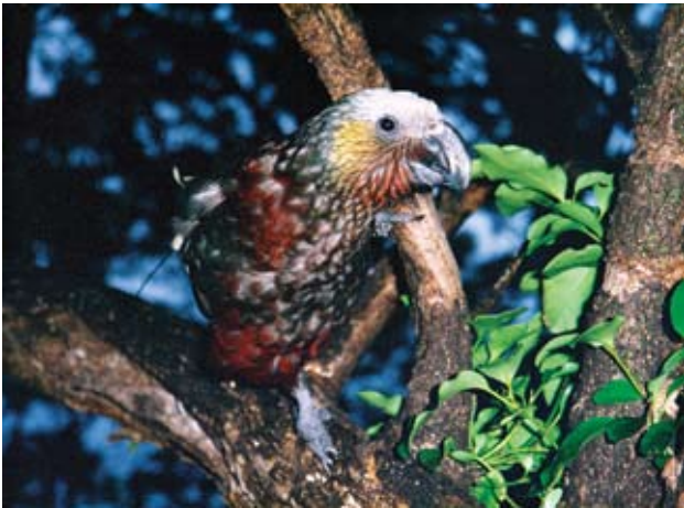
South Island kaka , Nestor meridionalis meridionalis .

The kaka monitoring programme came to an end in 2006 after the target objective was met: to monitor 30 successful kaka nesting attempts within the project. This was finally achieved over six kaka breeding seasons spanning nine years. From the 32 successful nesting attempts monitored, the project recorded a nesting success rate (chicks fledged successfully) of 63%. This compared with a nesting success rate of just 10% at a site outside the project area not protected by trapping. Inside the project area, 95% of nesting females survived compared to 20% at the comparison site. The results confirm that the current stoat control regime used in the project area would maintain and increase the kaka population.